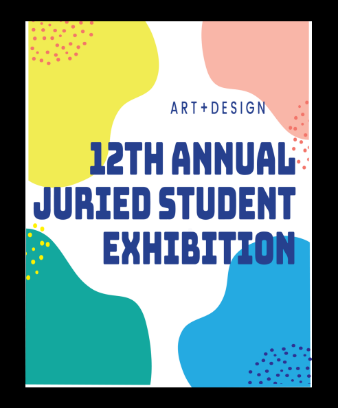
Opening Reception March 17th at 5PM