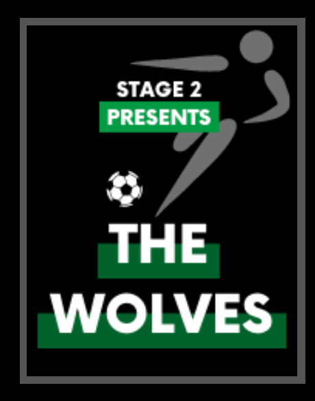
April 10th &11th at 2:00PM