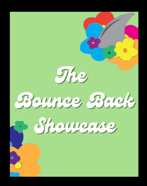
April 7th at 7:30PM