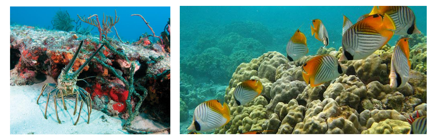
MMAs can be used to protect and enjoy the diverse life found on our coral reefs, but there are inherent challenges

Florida. This process was a multi-year consultation with relevant reef user groups that was intended to produce comprehensive management recommendations for the southeast region of the FRT. The idea was progressive – bring all the different interests to the table and have them come to a consensus on management strategies. The process moved along slowly and steadily, which had the unfortunate consequence that certain stakeholders did not remain engaged for the length of the process. When the final recommendations were set to be agreed upon, some of these groups came back to table to strongly oppose what they felt was contrary to their interests. These groups felt that their positions were not fairly represented during the process, while some members who has participated extensively throughout the process felt that their work was being stymied at the very end. It became clear that misunderstanding of some terminology, lack of consistent engagement, and entrenched mistrust led to tremendous difficulty even discussing spatial management strategies.