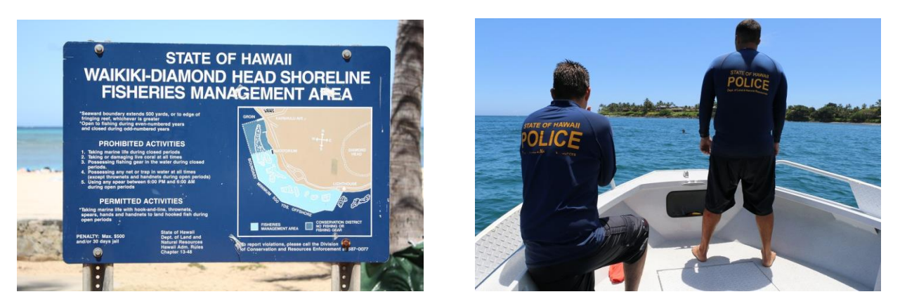
Enforcement off MMAs can be limited to signage or come with dedicated enforcement officers

coordinate their efforts towards similar goals. Neither of these goals nor their metrics should blanket the entire FRT due to the great diversity of habitat and stressors along the reef tract. However, providing specific metrics for common goals might allow spatial management to be more effective and tangible to user groups.