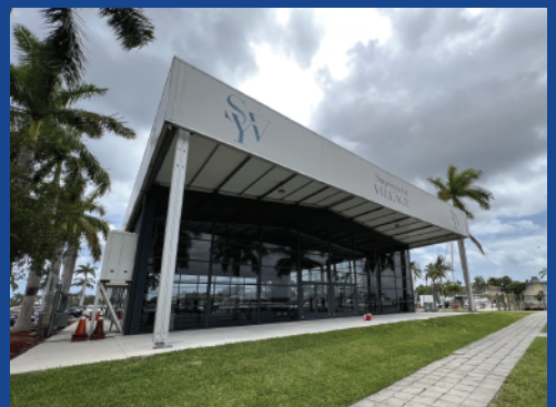
Superyacht Pavilion at Pier 66 South