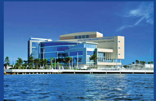
The Guy Harvey Oceanographic Research Center

Please have the Captain or a representative from each boat attend the Captain's Meeting during which we will provide important tournament information and rules.